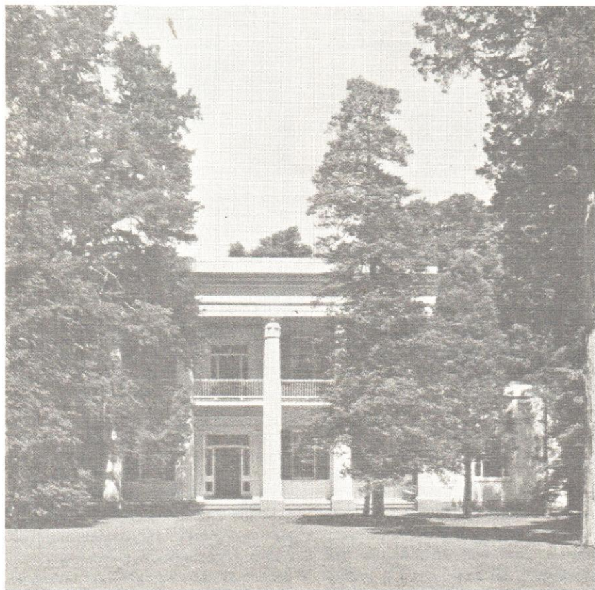
The Hermitage, home of Andrew Jackson