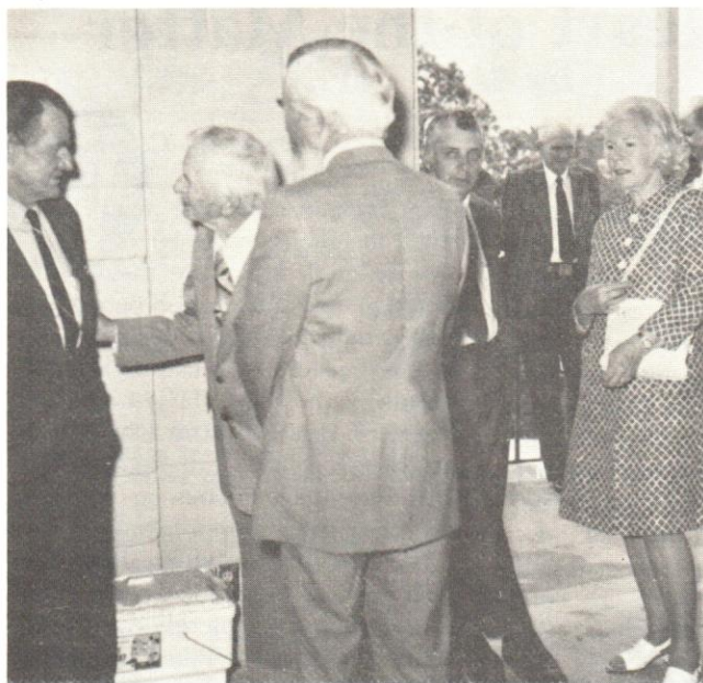
Left: "I'm so glad to meet you!"