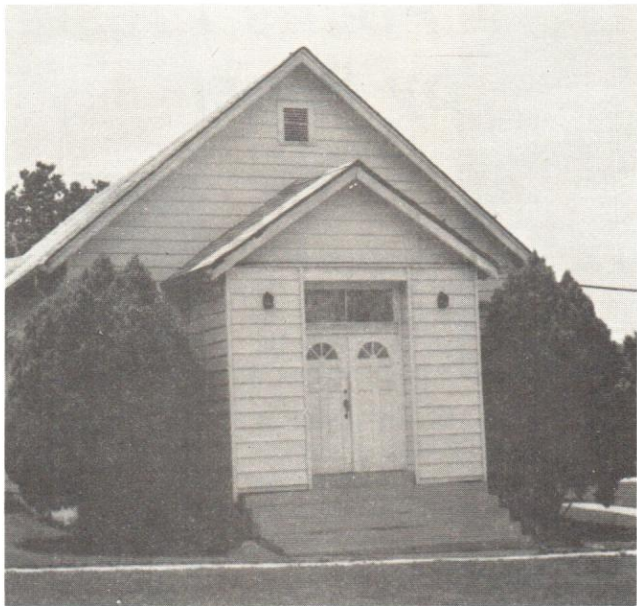
Hermitage Seventh-day Adventist Church