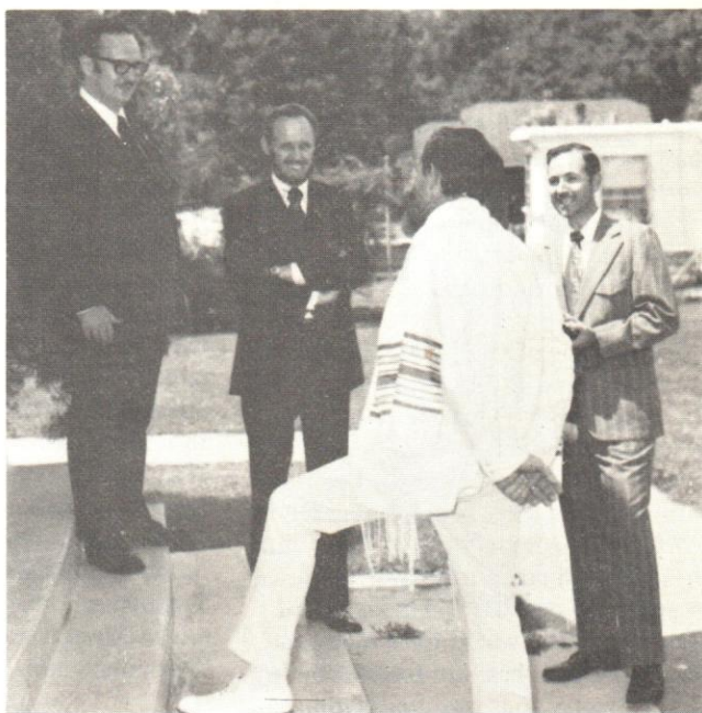
Left: whic deno